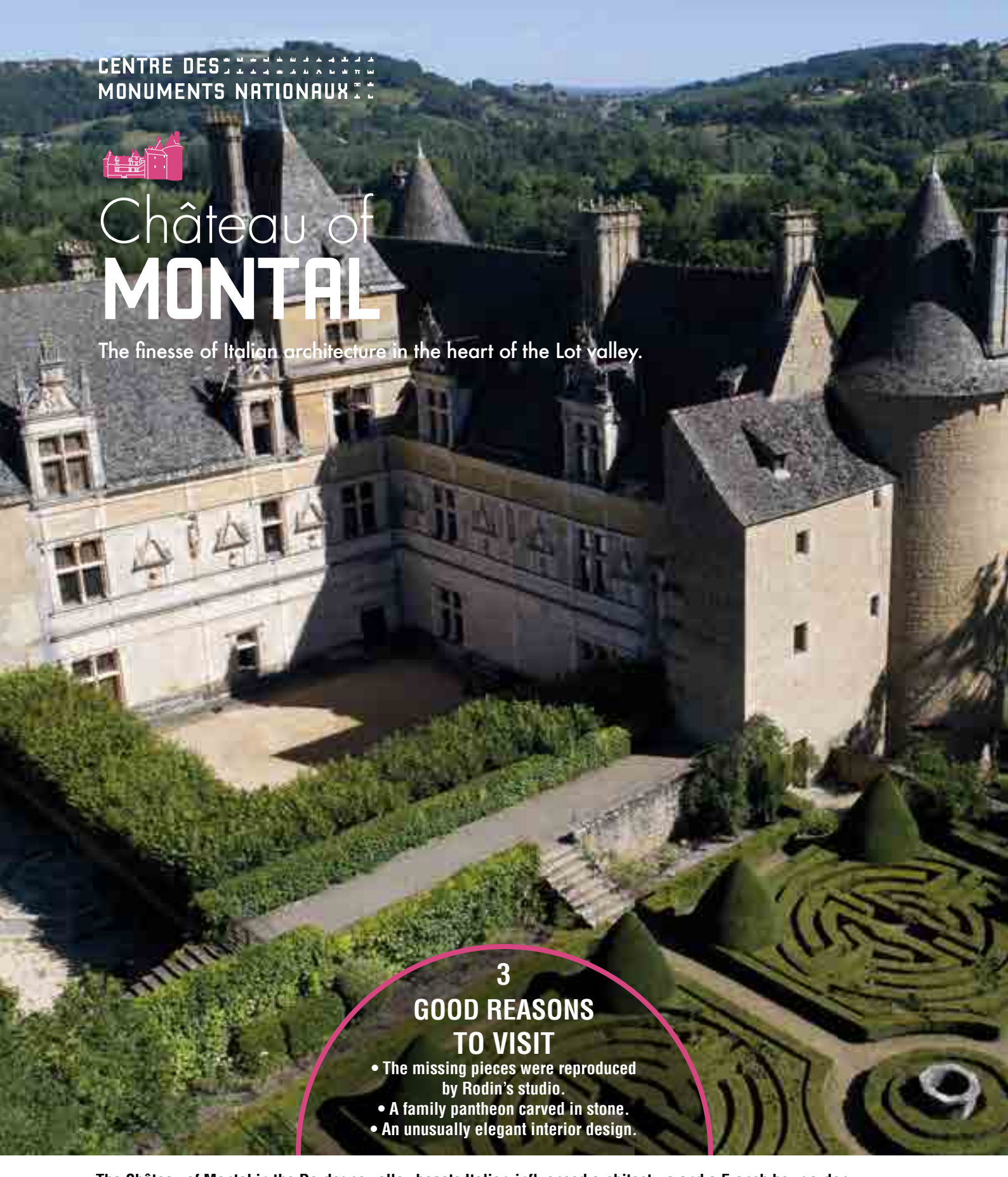
The Château of Montal in the Dordogne valley boasts Italian-influenced architecture and a French box garden.

From the finely adorned façades to the sculpted staircase and the ornate fireplaces to the tastefully furnished bedrooms, this property was clearly built on the orders of a woman of character, in this case Jeanne de Balsac. Over the centuries, it has been transformed from a luxurious residence to an inn and later a farmhouse, before its decorative pieces were sold at auction in the late-19th century. Having been saved by Maurice Fenaille,